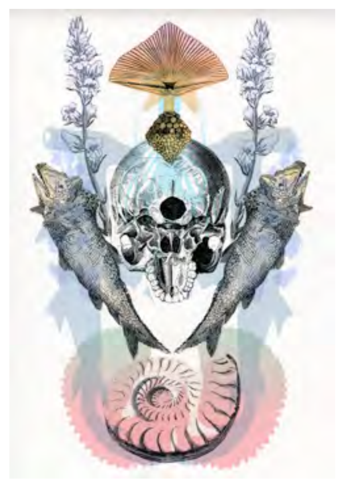
Untitled, Dominick Rapone