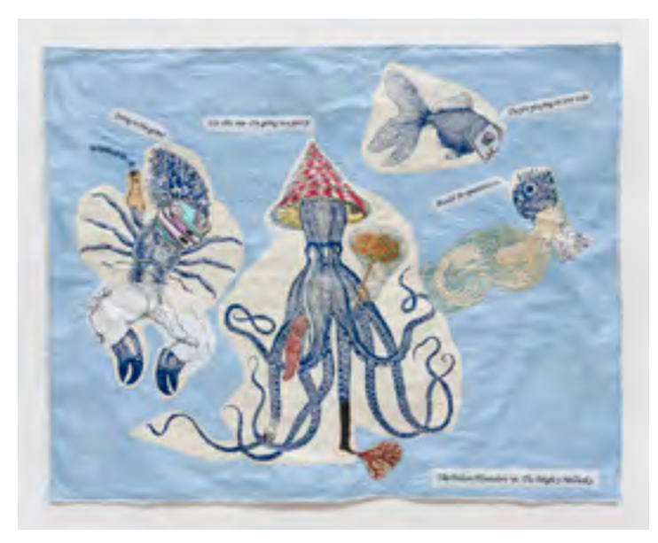
Sea Change, China Marks

On the other hand, contemporary artists can very often be like the canary in the coal mine warning of the presence of deadly gases. Artists can bring to light the changes in sea levels, and the industries that contribute to the problem by simply exposing, with visual and written references, a very troubling reality that we are in the thick of a political battle for our very future, and the futures of the animals and plants we